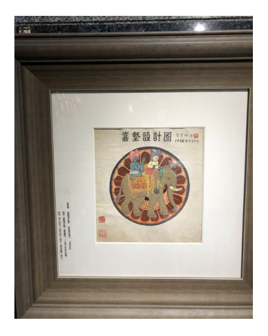
Photo of the murals inside the China Hall at Visva-Bharati University, Santiniketan, India, 2020. Chang Xiufeng's "Drawing of a cushion design" (1948). Exhibition of China-India Cultural and Artistic Exchange in Santiniketan (Homeland of Peace) at Peking University, 2019.