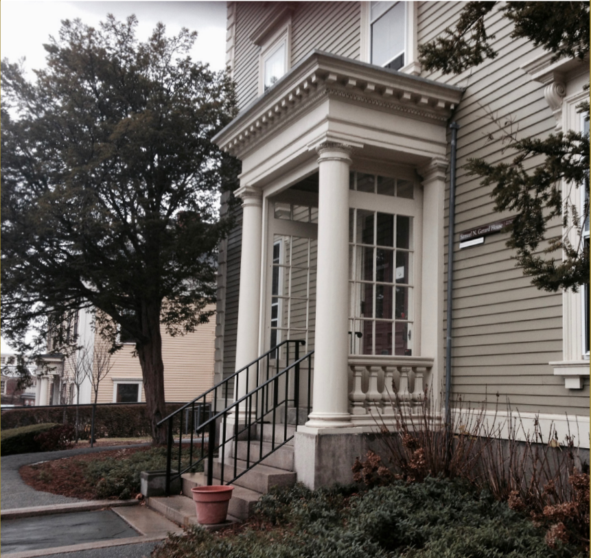
Gerard House, 2015