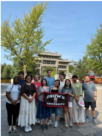
The group at the Shaolin Temple

4. To introduce Chinese calligraphy and painting, I transformed my hotel room into a studio (see attached pictures). Surprisingly, the hotel rooms proved to have this function!